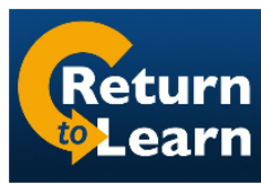
School Board Approves Waiver for Virtual Start to School Year