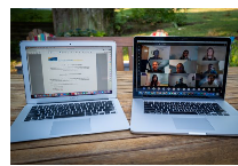
DMPS Welcomes a Motivated Batch of New Educators