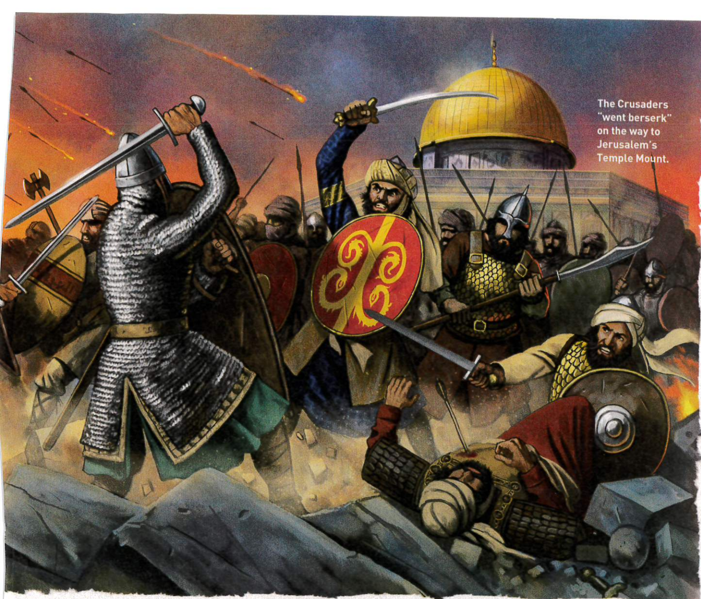
The Crusaders "went berserk" on the way to Jerusalem's Temple Mount.